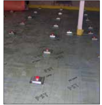
Conditioning the premise and installation of the mounts.